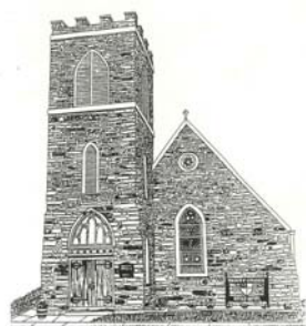
January at Trinity

Trinity Episcopal Church 703 S. Main Street Office: 701 S. Main Athens, PA 18810